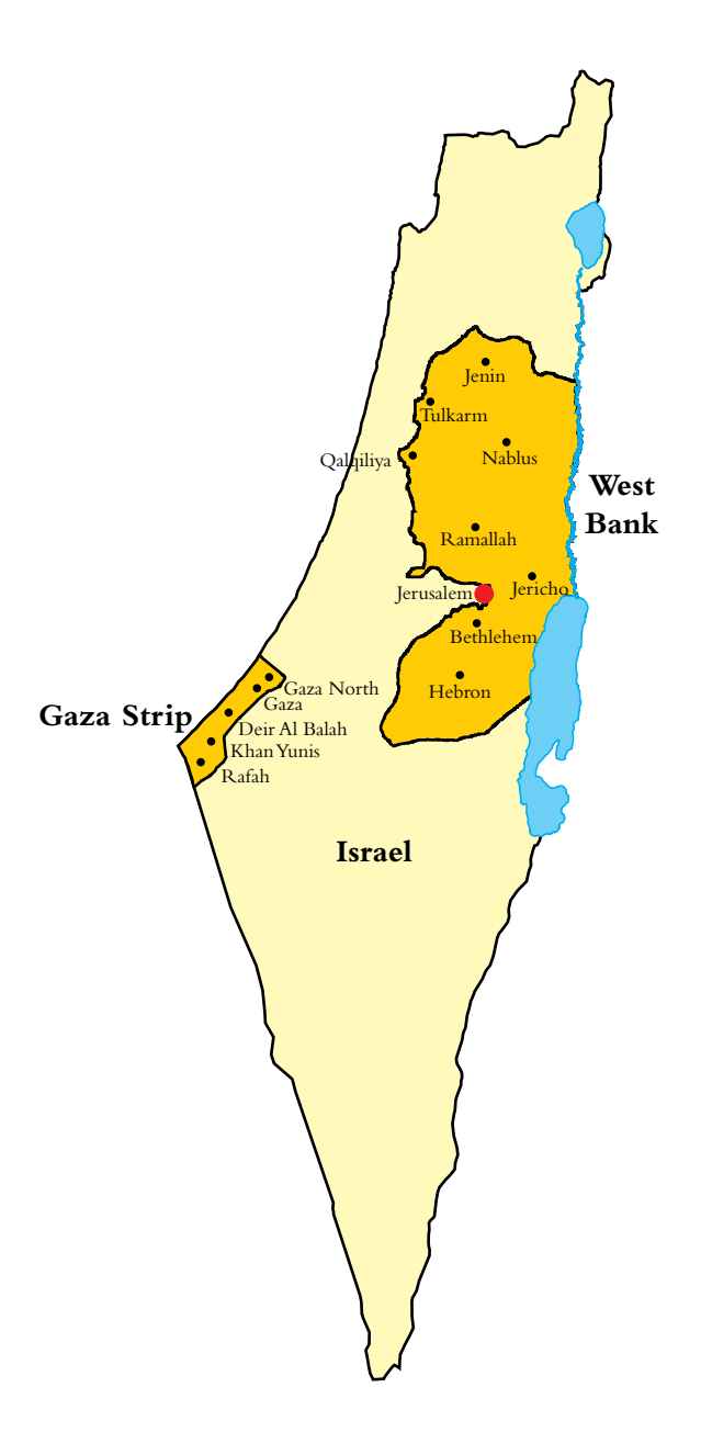
Map 1 – Israel and the Occupied Palestinian Territory