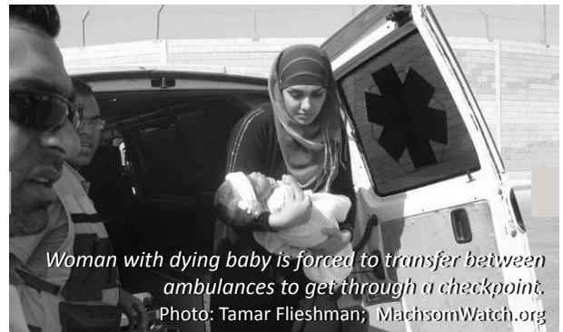
Woman with dying baby is forced to transfer between ambulances to get through a checkpoint.

Interminable delays at checkpoints make normal life impossible. Driving a few kilometers in occupied territory often takes hours, strangling the Palestinian economy and affecting every facet of life.