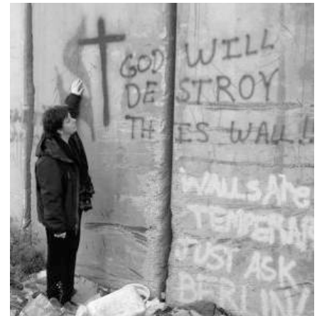
The UMC Cross and Flame painted on the Separation Wall in Palestine. The words on the wall read: "God will destroy this wall" and "Walls are temporary, just ask Berlin!"

For decades, Christians living in the Holy Land have endured a harsh military occupation that has become an apartheid regime. In December 2009, they issued a powerful call to the global Church - to take concrete action to help them regain their freedom - in Kairos Palestine: A Moment of Truth . Drawing upon the legacy of the South African Kairos Document , endorsed by the Patriarchs and Heads of Churches in Palestine, and inspired by God's grace and love, Kairos Palestine is a profound statement of faith, a vivid description of life under occupation, and a call to action for Christians everywhere - to help bring freedom, equality, and a lasting peace to all the people of Israel and Palestine. In their own words, excerpts from Kairos Palestine : "The Israeli occupation is an evil and a sin that must be resisted and removed...love puts an end to evil by walking in the ways of justice....Taking action to end the oppression is not working against Israel....It will benefit both peoples, when justice and the peace that comes from that are secured for all the people of the Holy Land....Our word to the churches of the world is a call to stand alongside the oppressed....Our question to our brothers and sisters in the Churches is: Are you able to help us get our freedom back, for that is the only way you can help the two peoples attain justice, peace, security, and love."