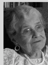
Hedy Epstein, Holocaust survivor and human rights advocate:

Palestinians live with the constant fear that in an emergency they will not be able to reach a hospital. Many patients have died or suffered irreversible setbacks at checkpoints; dozens of newborns have died when their mothers had to give birth there. Such policies should be unthinkable in a civilized society, even for the inmates of an actual prison.