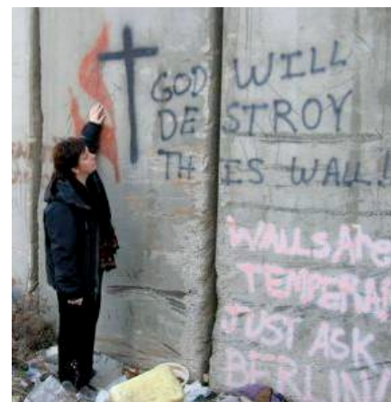
The UMC Cross and Flame painted on the Separation Wall in Palestine. The words on the wall read: "God will destroy this wall" and "Walls are temporary, just ask Berlin!"

For decades, Christians living in the Holy Land have endured a harsh military occupation that has become an apartheid regime. In December 2009, they issued a powerful call to the global Church - to take concrete action to help them regain their freedom - in Kairos Palestine: A Moment of Truth . Drawing upon the legacy of the South African Kairos Document , endorsed by the Patriarchs and Heads of Churches in Palestine, and inspired by God's grace and love, Kairos Palestine is a profound statement of faith, a vivid description of life under occupation, and a call to action for Christians everywhere - to help bring freedom, equality, and a lasting peace to all the people of Israel and Palestine. In their own words, excerpts from Kairos Palestine : "The Israeli occupation is an evil and a sin that must be resisted and removed...love puts an end to evil by walking in the ways of justice....Taking action to end the oppression is not working against Israel....It will benefit both peoples, when justice and the peace that comes from that are secured for all the people of the Holy Land....Our word to the churches of the world is a call to stand alongside the oppressed....Our question to our brothers and sisters in the Churches is: Are you able to help us get our freedom back, for that is the only way you can help the two peoples attain justice, peace, security, and love."