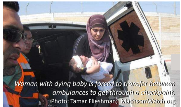
Woman with dying baby is forced to transfer between ambulances to get through a checkpoint.

Interminable delays at checkpoints make normal life impossible. Driving a short distance in occupied territory often takes hours, strangling the Palestinian economy and affecting every facet of life.