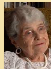
Hedy Epstein, Holocaust survivor and human rights advocate:

Palestinians live with the constant fear that in an emergency they will not be able to reach a hospital. Many patients have died or suffered irreversible setbacks at checkpoints; dozens of newborns have died when their mothers had to give birth there. Such policies should be unthinkable in a civilized society, even for the inmates of an actual prison.