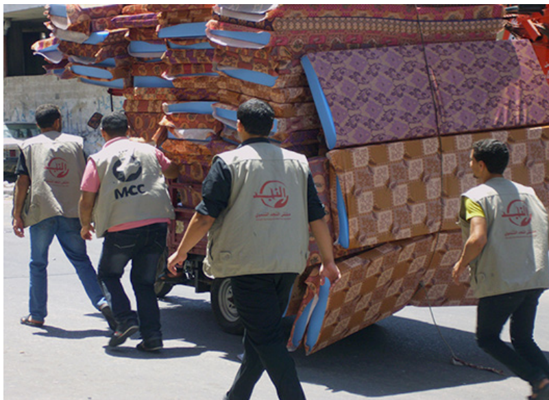
Volunteers wearing MCC and Al Najd Development Forum vests deliver mattresses to families who opened their homes to other Gazans displaced by the Israel-Hamas conflict in 2014. MCC provided bedding and related supplies distributed through partner organization Al Najd.

Gaza's situation is particularly difficult. The Gaza Strip is 40 kilometers (25 miles) long and, at its widest point, 13 kilometers (8 miles) wide. Since 1994, Israel has enclosed Gaza with a fence on three sides and by control of the Mediterranean Sea on the west. In 2006, Palestine elected Hamas (an Islamist militant group) to govern, though ultimately their political leadership was confined to Gaza. Some voters favored an Islamic state,