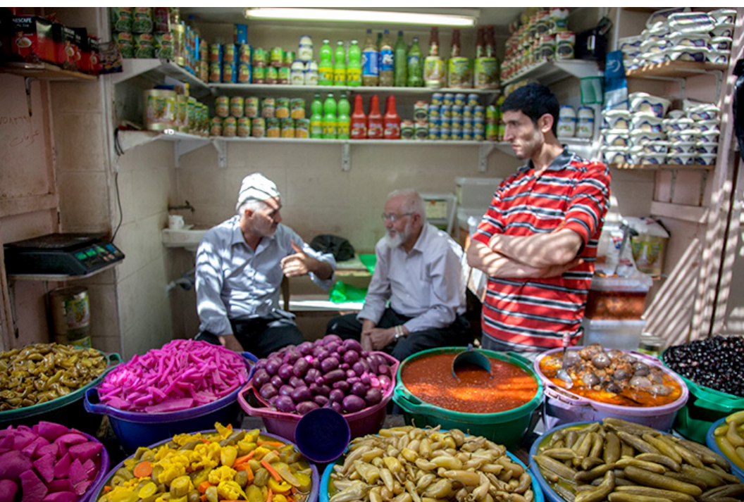
Vendors sell pickled vegetables and olives at a market in the city of Hebron.

Wherever we work, MCC is on the side of a just peace between societal groups or people in conflict. MCC does not choose one people group over another. “MCC does ‘take sides’ with the good news of Christ that reconciliation between enemies is possible and that reconciliation involves the doing of justice. MCC does ‘take sides’ against all forms of violence, regardless who perpetrates it.