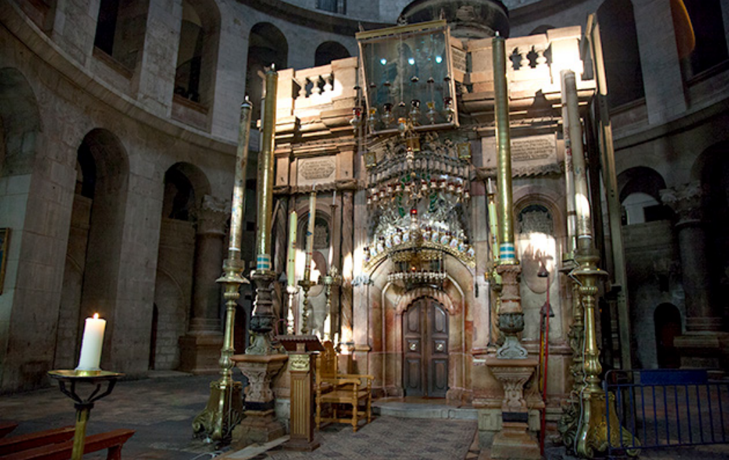
The Aedicule—a chapel that tradition says contains both Jesus’ tomb and the stone that sealed it—rests under a dome of the Church of the Holy Sepulchre in Jerusalem.

Christians embrace Jesus’ words to love God, neighbor and enemy, and to pray for those who persecute us. 11 Jesus, the Jewish teacher, says that on love of God and neighbor hang all the law, or Torah, and prophets. 12 As in all matters regarding a theology of land and chosenness, followers of Jesus are called to love all people, the Jewish neighbor as well as the Palestinian neighbor. 13