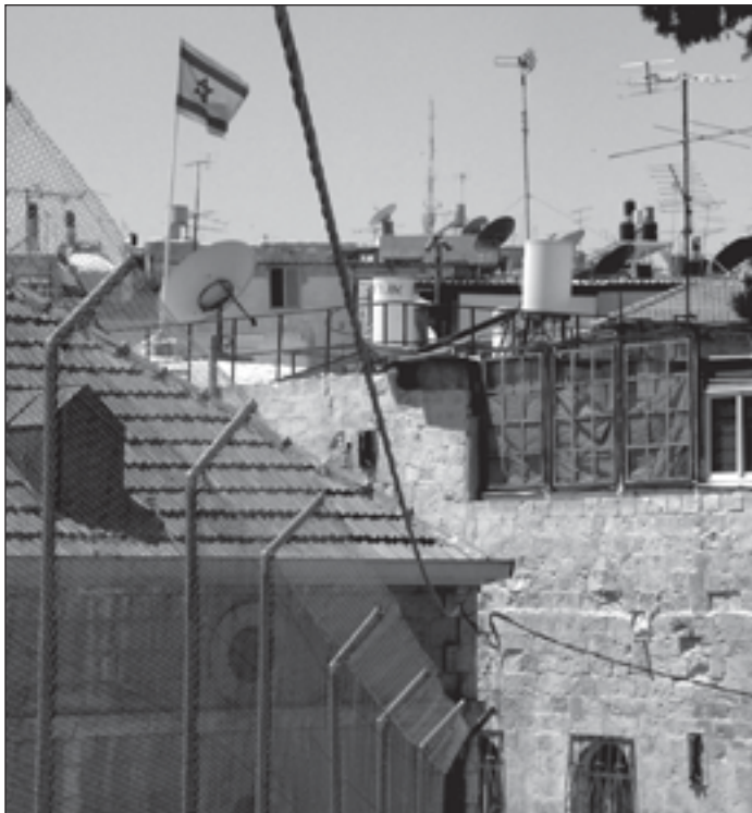
An Israeli Settlement in East Jerusalem's Old City.