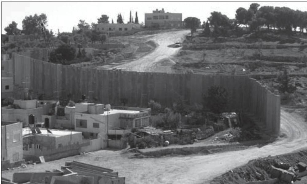
The Wall cutting through the Abu Dis area of Jerusalem.

permit. The closure severed East Jerusalem from its economic hinterland in the West Bank. Palestinians consider E. Jerusalem to be their social, cultural, economic, religious, and political capital. The severe damage to the Palestinian economy has resulted in higher unemployment; some Palestinian retailers in East Jerusalem have closed while others have moved outside the municipal borders of Jerusalem. As East Jerusalem becomes further isolated by the construction of the separation Wall, the economic effects of Israeli policies on the Palestinians are expected to increase.