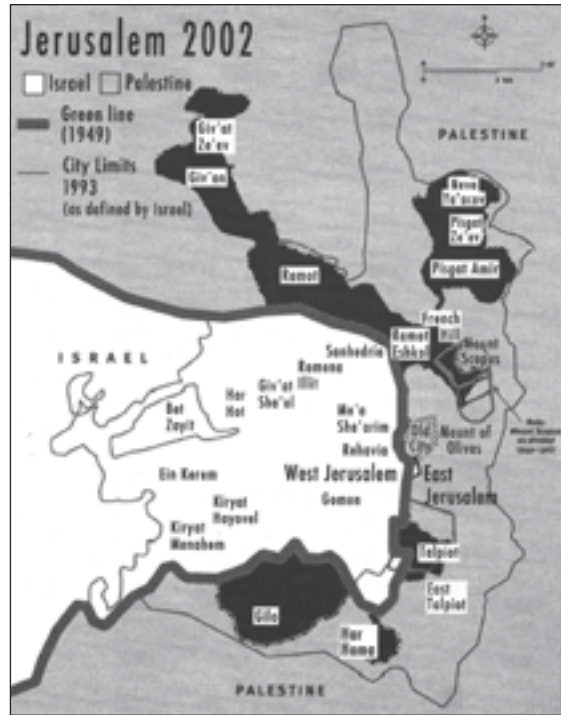
Greater Jerusalem showing West and East Jerusalem, including the Israeli settlements (black type in white boxes) built in East Jerusalem since 1967. Adapted from Foundation for Middle East Peace

*See, for example: M. Benvenisti, Jerusalem: The Torn City; Jerusalem, Extending the Area of Jurisdiction (April 1991) Municipal Planning Report.