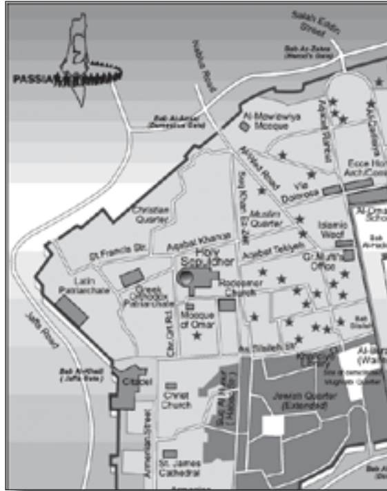
Map of East Jerusalem's Old City. Map: PASSIA

Foundations of the Old City stretch back to the Early Bronze Age (c. 3000BCE) when the city was a Canaanite center. The city later became the capital of the Hebrew kingdom. After subsequent occupations, the city fell under