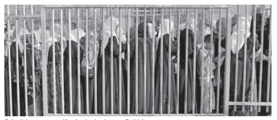
Palestinian women waiting in checkpoint near Bethlehem.